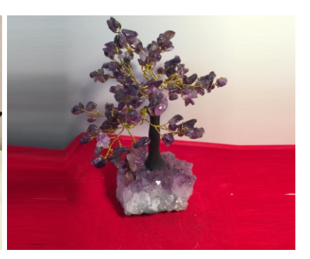
·Wide Variety of Different Stones ·Available in Different Sizes.