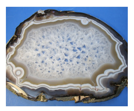
Large Agate Slice